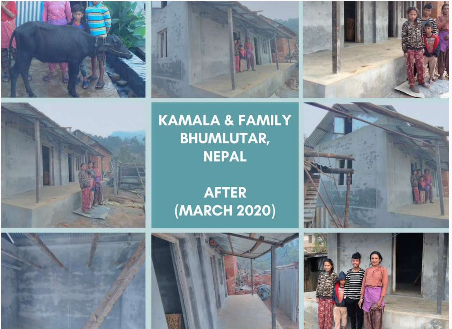
Kamala and children's house after (Mar/Apr 2020)

Pair of locally raised turkeys = Cost: NPR2,000 / USD$ 16.67 / NZD$ 27.14